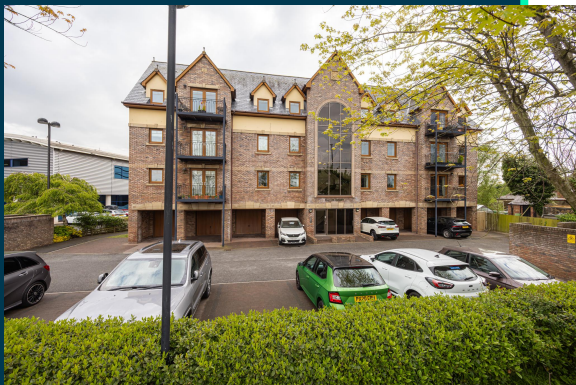
Reiver Court, Carlisle, CA3