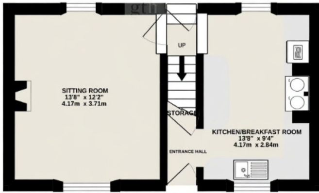
GROUND FLOOR 324 sq.ft. (30.1 sq.m.) approx.

TOTAL FLOOR AREA: 648 sq.ft. (60.2 sq.m.) approx. Measurements are approximate. Not to scale. Illustrative purposes only Made with Metropix ©2022