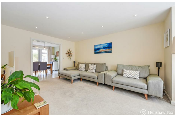
44 Knights Meadow | £550,000 North Baddesley, Hampshire, SO52 9AF