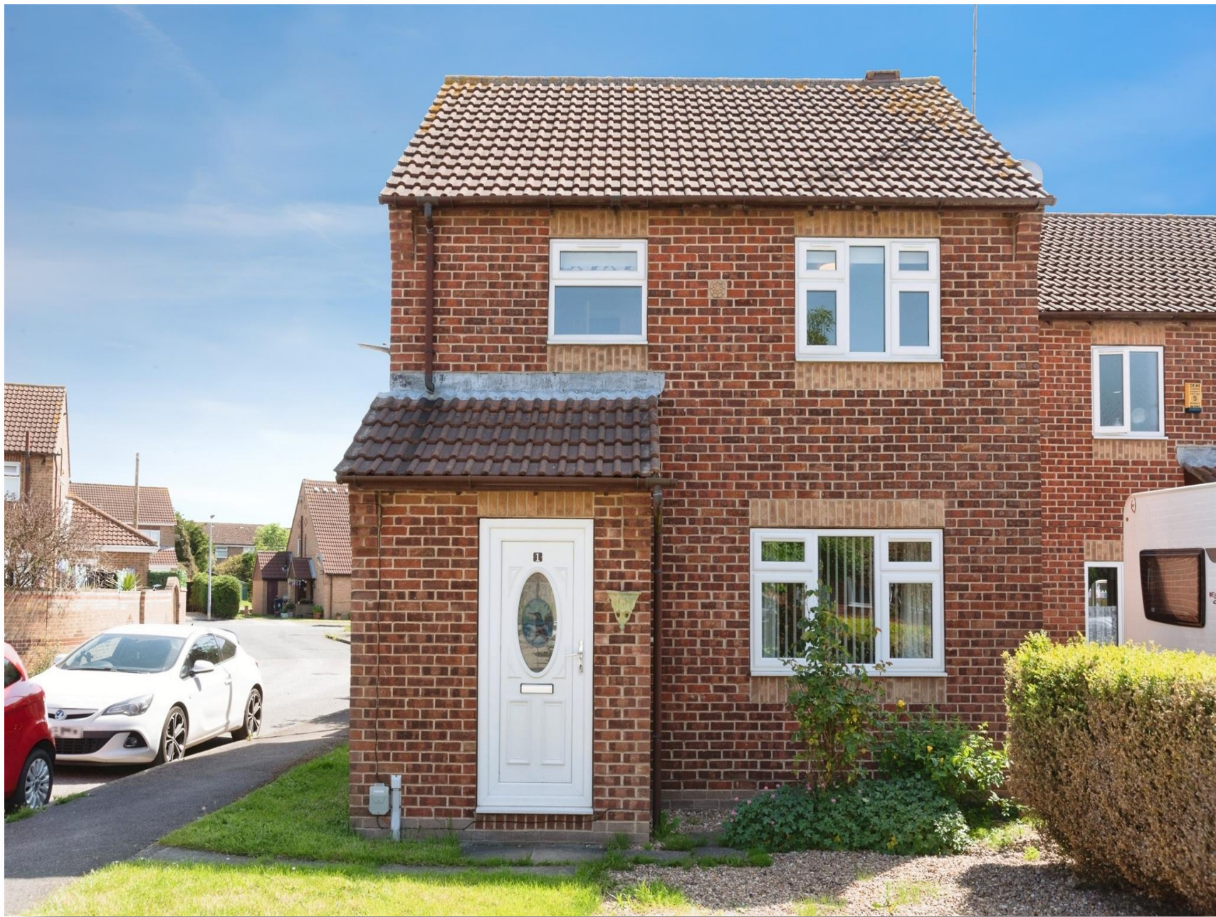
Emberton Park, Kingswood, Hull, HU7 3EP