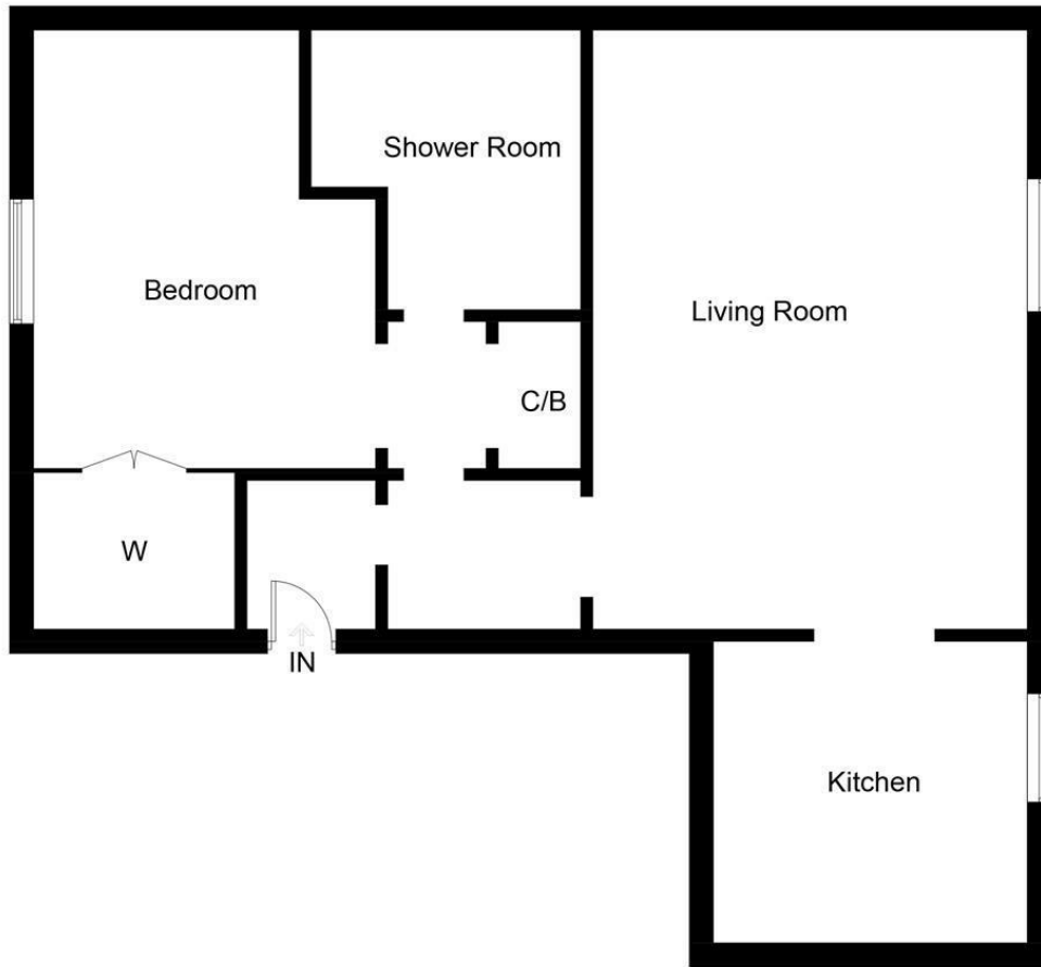
Illustration for identification purposes only, measurements are approximate, not to scale. Fourlabs.co © (ID1307229)