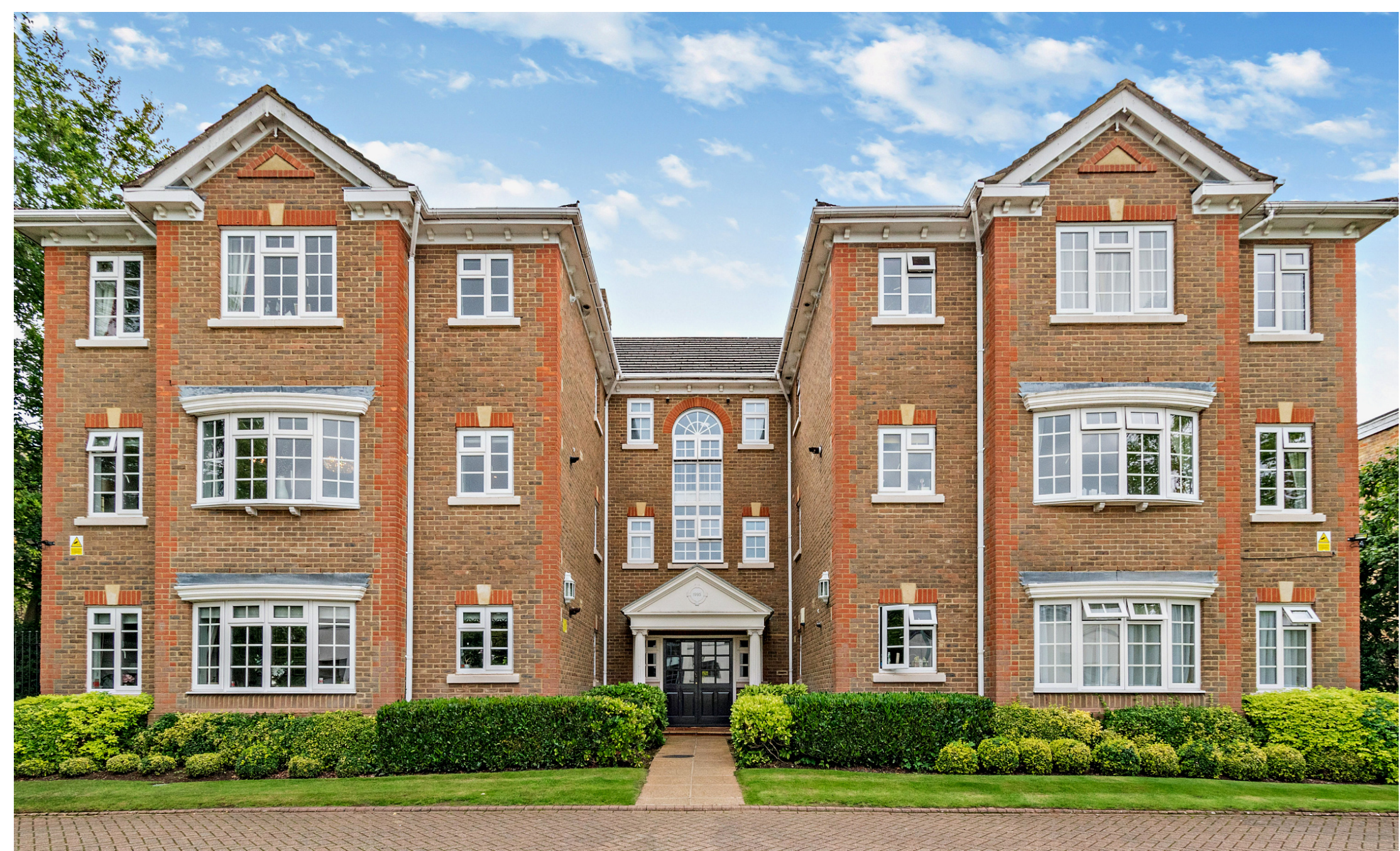
A two bedroom two bathroom well presented first floor apartment Eastbury Avenue, Northwood, HA6 3JP