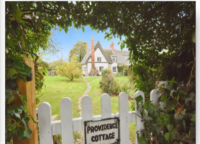
Providence Cottage, Gainsford End, Toppesfield, Halstead CO9 4EG