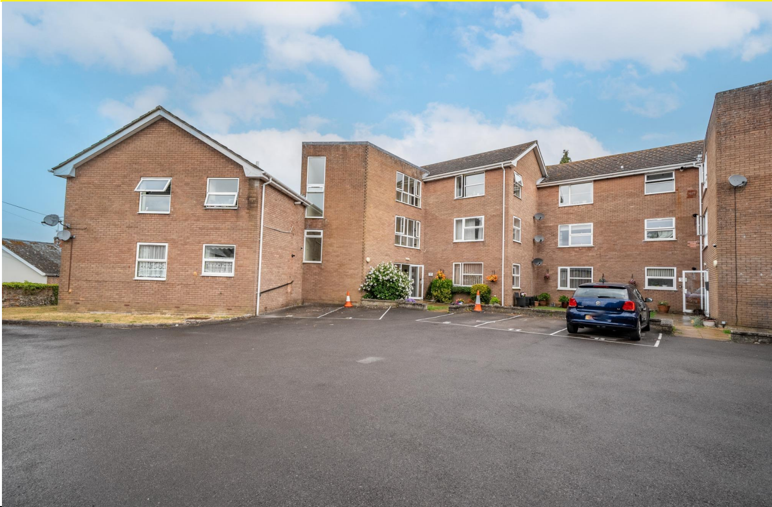
Gales Court, Andover