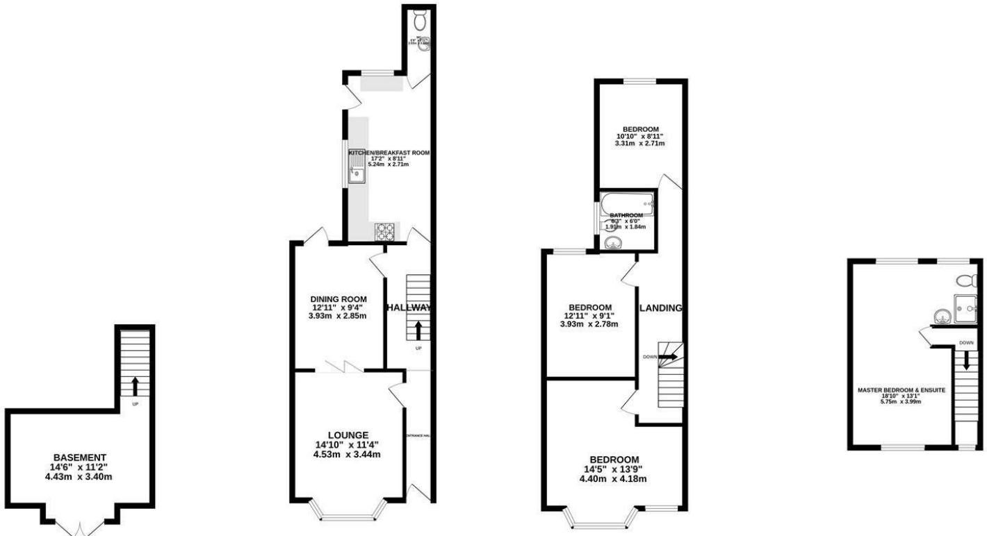
2ND FLOOR 247 sq.ft. (22.9 sq.m.) approx.

TOTAL FLOOR AREA : 1514 sq.ft. (140.6 sq.m.) approx.