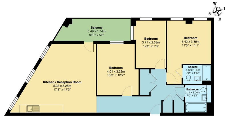
8th Floor Total Area: 86.5 m 2 ... 931 ft 2 (excluding balcony) All measurements are approximate and for display purposes only.