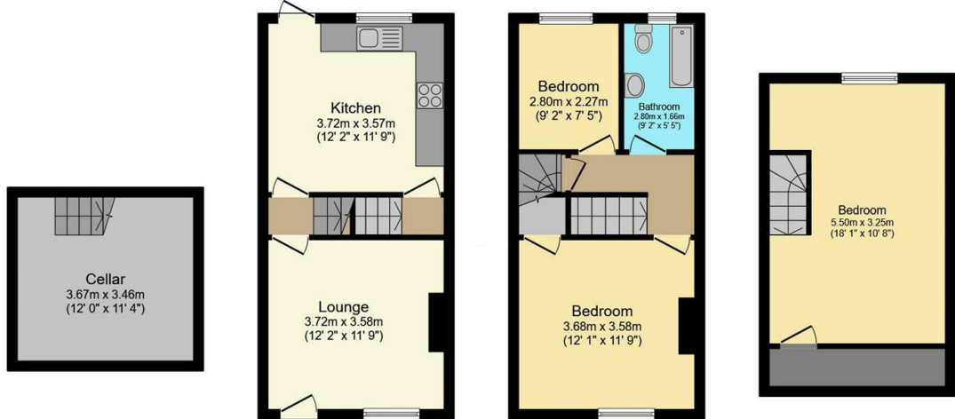
Cellar 3.67m x 3.46m (12' 0" x 11' 4") Floor area 12.9 sq.m. (139 sq.ft.)