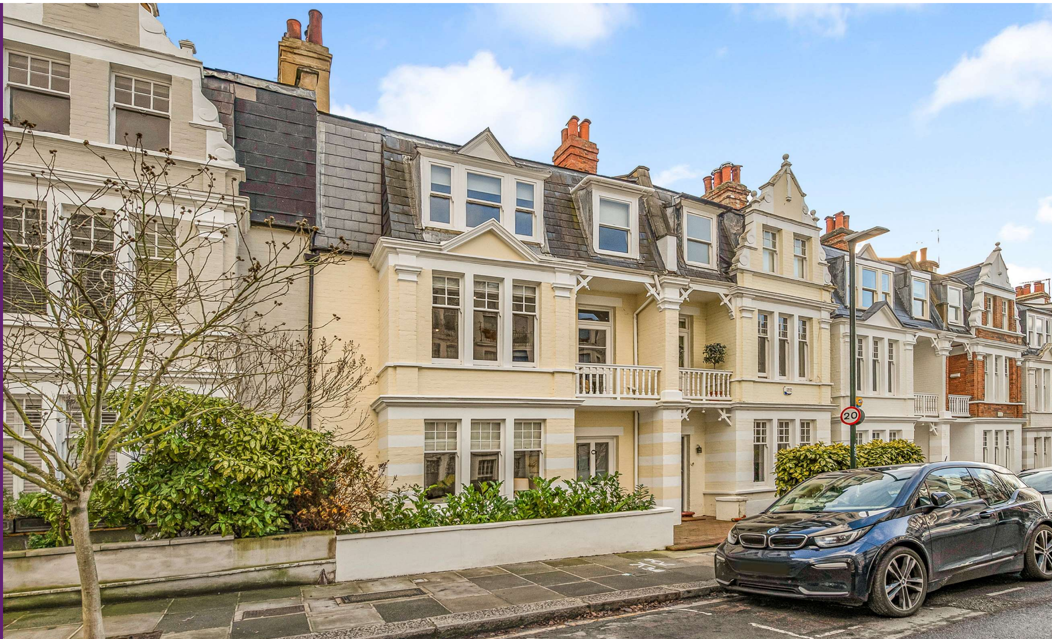
Onslow Avenue Richmond, TW10