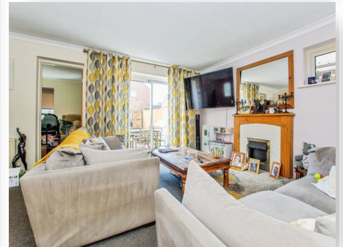
Prince Of Wales Close, Wisbech PE13 3HN