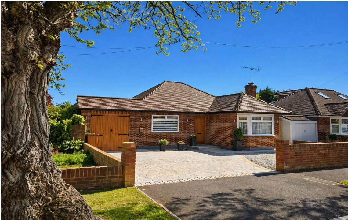
Grosvener Road, Staines, TW18 2RW