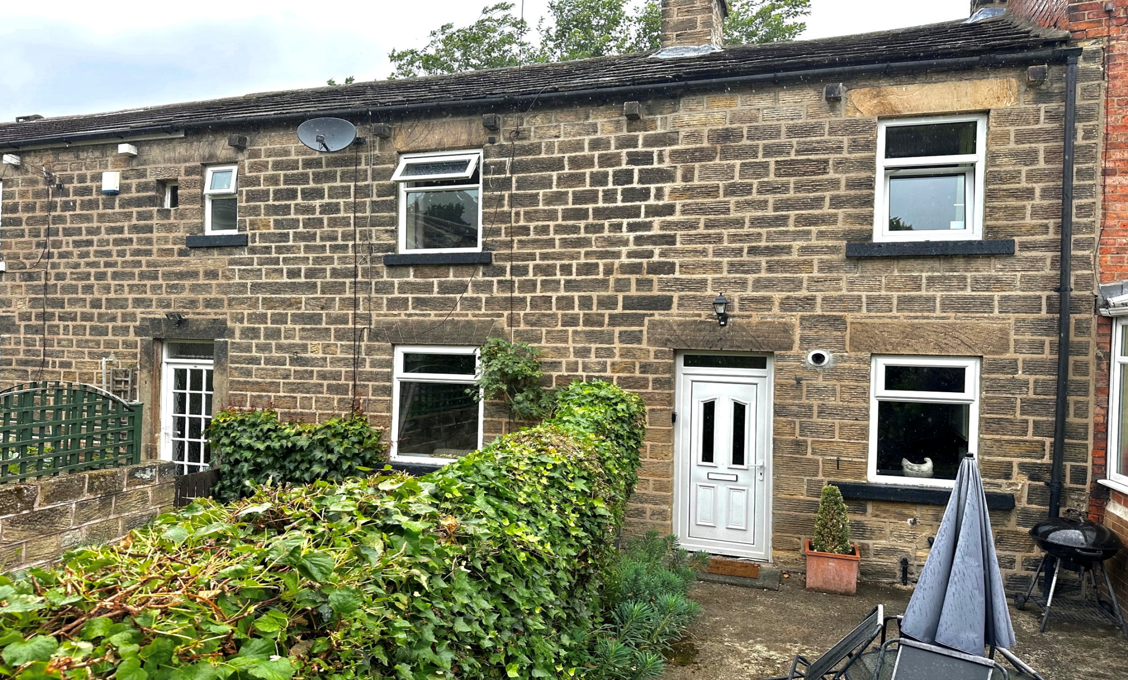
Almshouse Lane, Newmillerdam Wakefield WF2 7ST