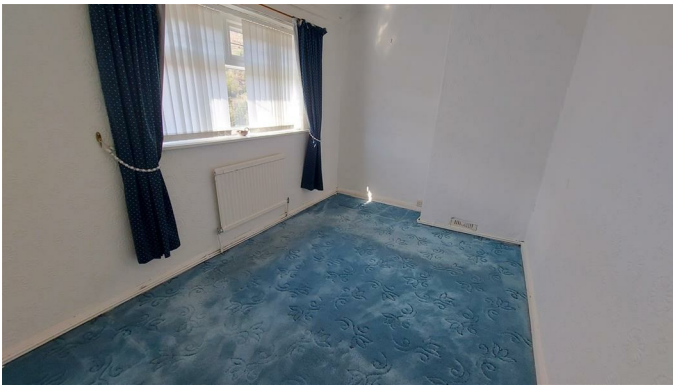
Bedroom Two 12'9" x 8'2" (3.9 x 2.5)

Skimmed and covered ceiling, papered walls, fitted carpet, radiator and uPVC double glazed window to front.