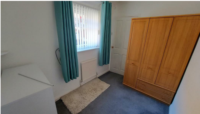
Bedroom Three 9'10" x 6'6" (3.0 x 2.0)

Papered and covered ceiling, papered walls, fitted carpet, radiator and uPVC double glazed window to rear.