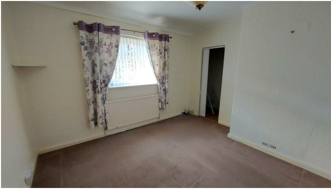
Bedroom One 11'9" x 11'9" (3.6 x 3.6)

Skimmed and covered ceiling, papered walls, fitted carpet, radiator, storage cupboard over stairwell and uPVC double glazed window to front.