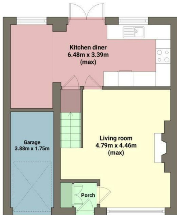
Ground floor Area: 44.14 m 2

A beautifully presented three bedroom extended property situated within walking distance to Stadt Moers Park, Whiston Village and transport links. The spacious accommodation briefly comprises of entrance hall, lounge with feature fireplace and dining kitchen with built in appliances and modern units. On the first floor are three double bedrooms with an en suite bathroom and a family shower room. The rear garden has a lawn, shrubs and summerhouse. The front garden is lawned with shrubs, impressed gravel driveway leading to a workshop. We recommend an early viewing of this substantial family home. EPC GRADE: C