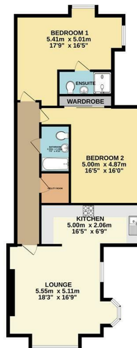
TOTAL FLOOR AREA: 90.1 sq.m. (969 sq.ft.) approx.

Whilst every attempt has been made to ensure the accuracy of the floorplan contained herein, measurements of doors, windows, rooms and any other items are approximate and no responsibility is taken for any error, omission or mis-statement. This plan is for illustrative purposes only and should be used as such by any prospective purchaser. The services, systems and appliances shown have not been tested and no guarantee as to their operability or efficiency can be given. Made with Metropix (2023)