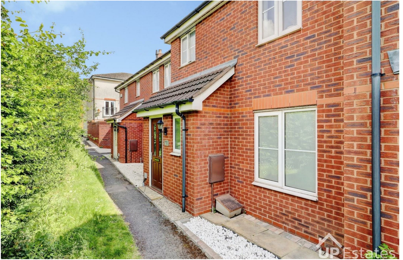
Humber Road, Coventry