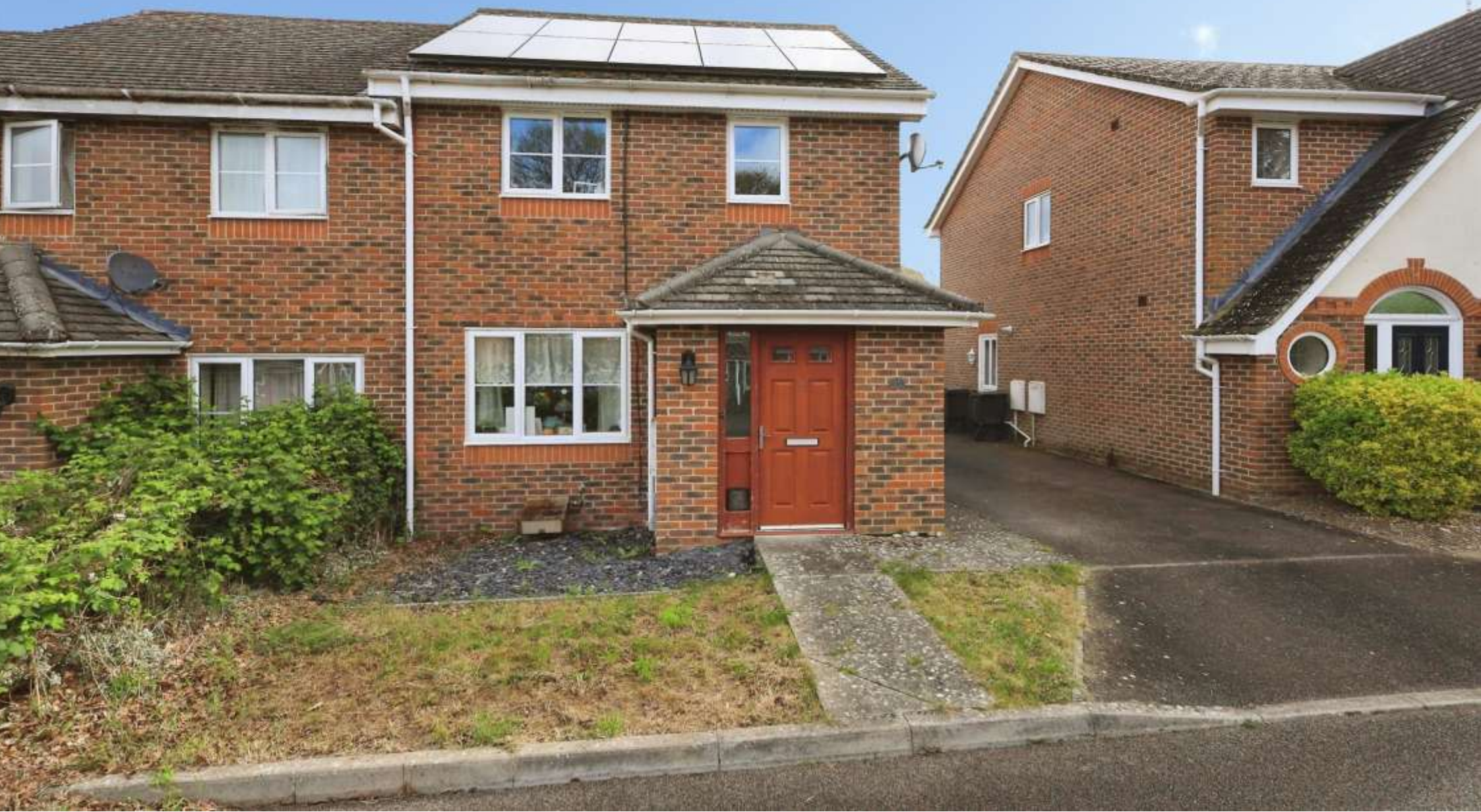
Cuckmere Close, Hailsham BN27 3FT