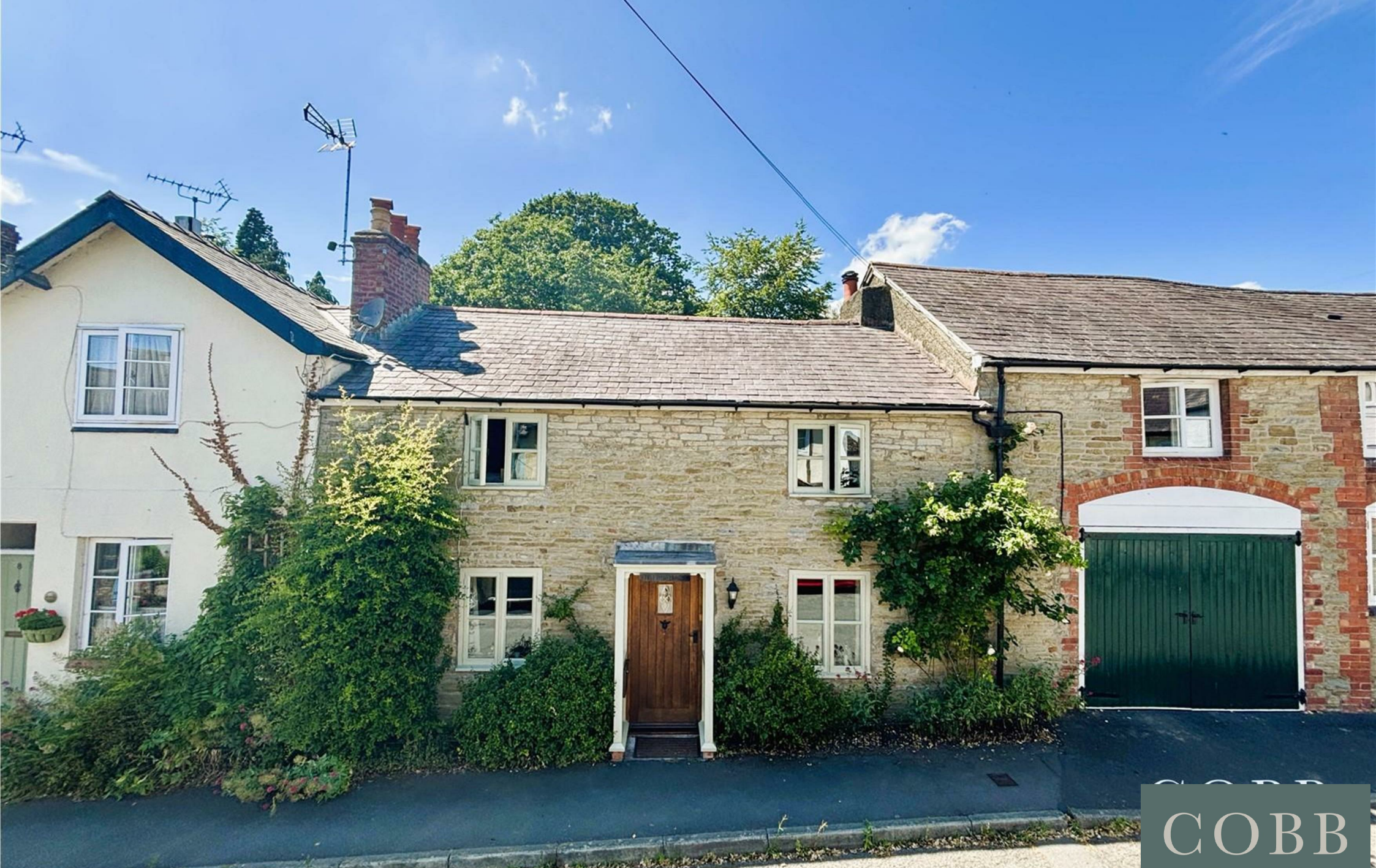
The Little House, Watling Street, Leintwardine, SY7 0LW Offers In The Region Of £325,000