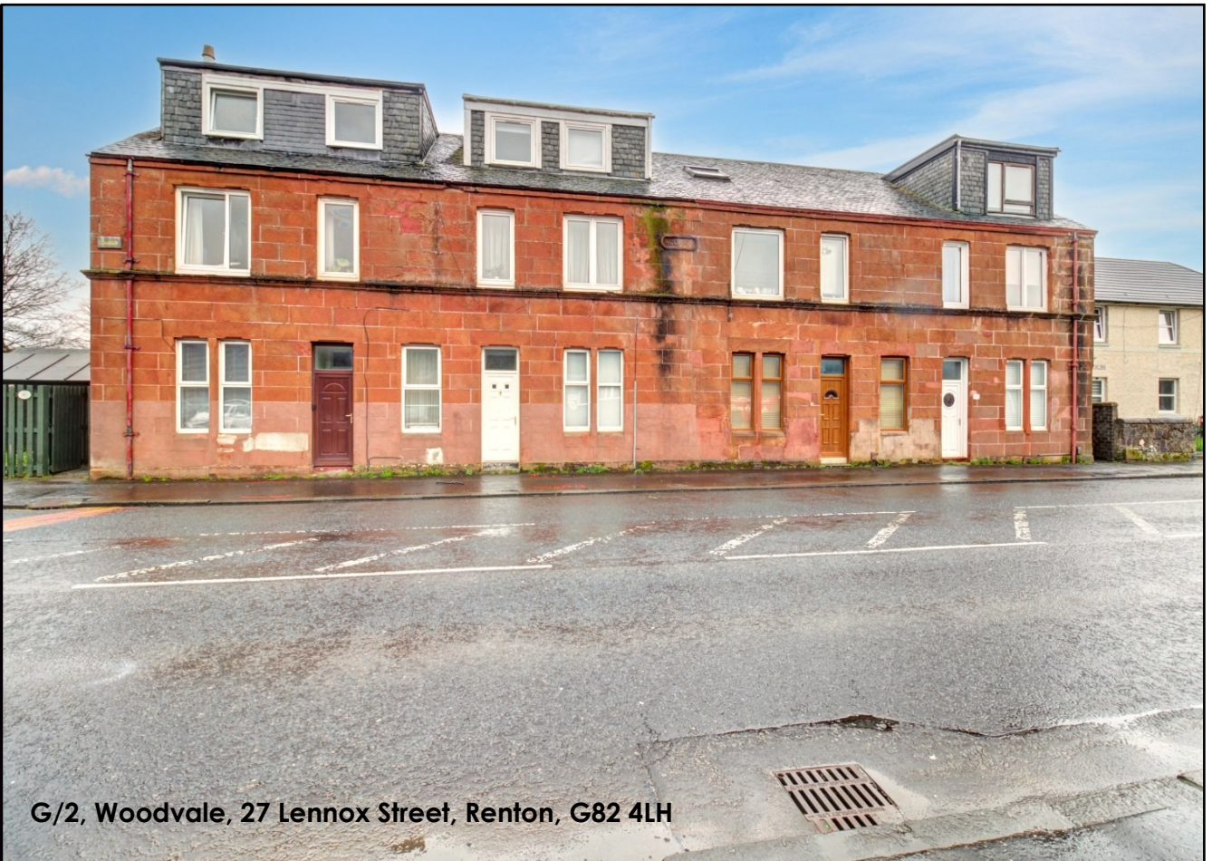
G/2, Woodvale, 27 Lennox Street, Renton, G82 4LH