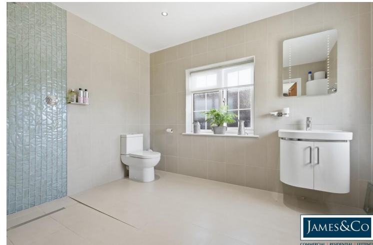
JAMES&CO COMMERCIAL | RESIDENTIAL | LETTINGS