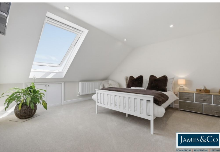
JAMES&CO COMMERCIAL | RESIDENTIAL | LETTINGS