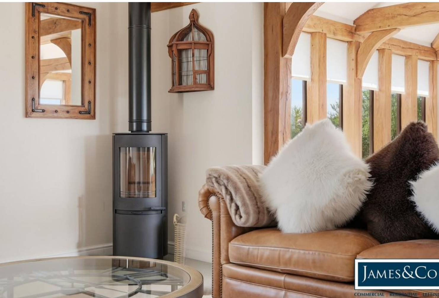
JAMES&CO COMMERCIAL | RESIDENTIAL | LETTINGS