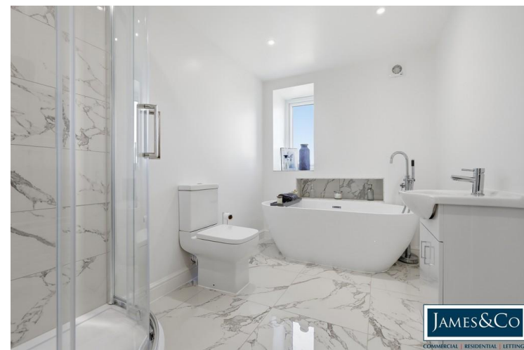
JAMES&CO COMMERCIAL | RESIDENTIAL | LETTINGS