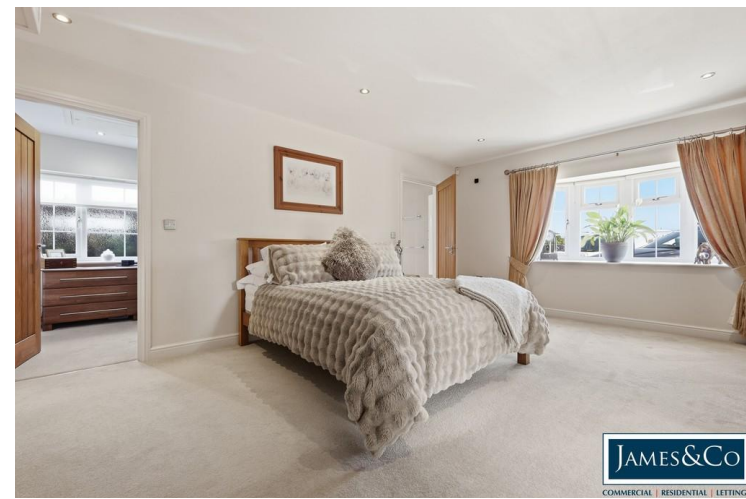
JAMES&CO COMMERCIAL | RESIDENTIAL | LETTINGS