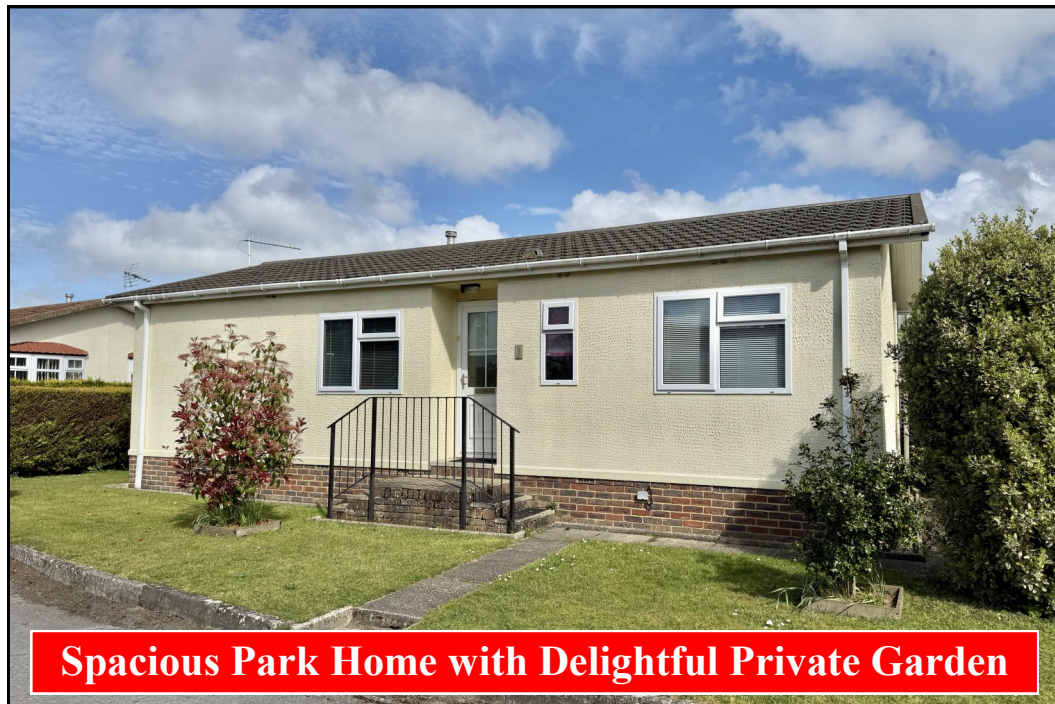
Spacious Park Home with Delightful Private Garden

1 St Leonards Farm Park, Ringwood Road, West Moors, Dorset. BH22 0AQ