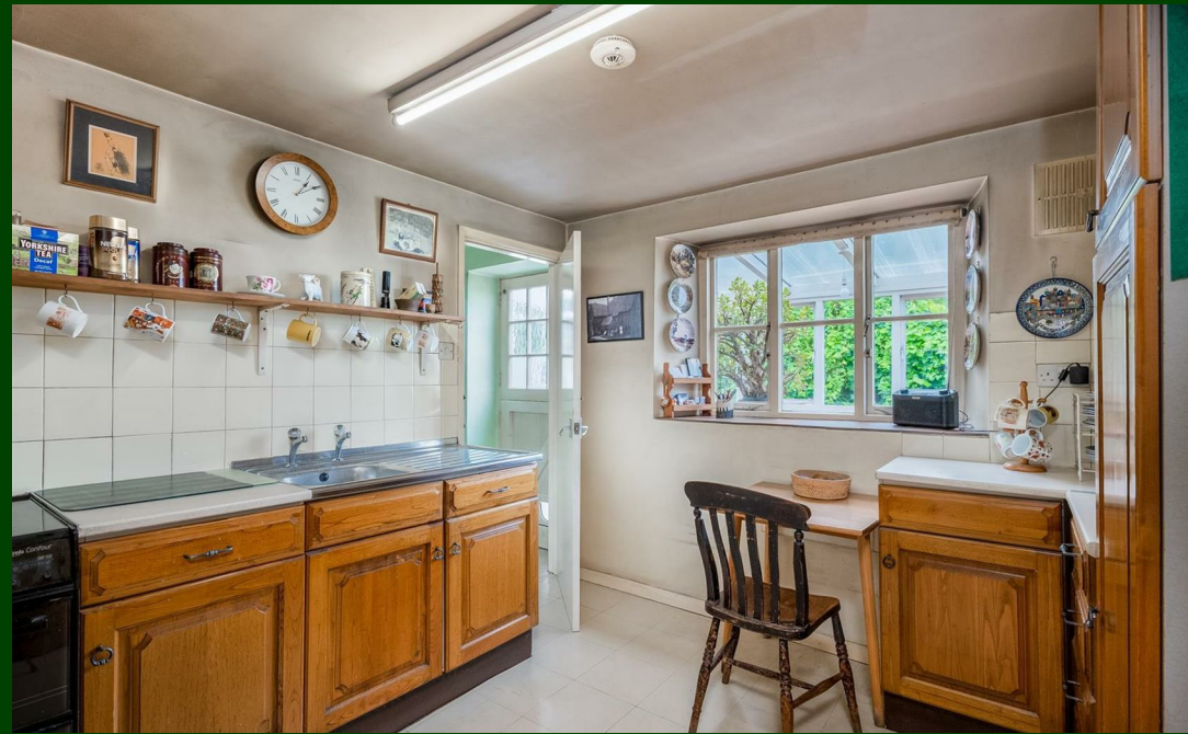
1 Church Street Charlbury Oxfordshire OX7 3PW Telephone: 01608 811146