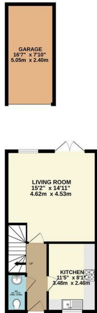
GROUND FLOOR 525 sq ft. (48.8 sq.m.) approx.