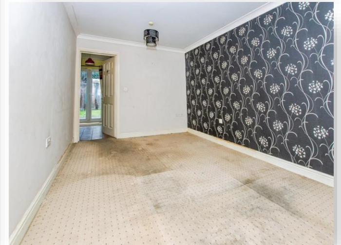
The Oaks, Elm Wisbech PE14 0JR