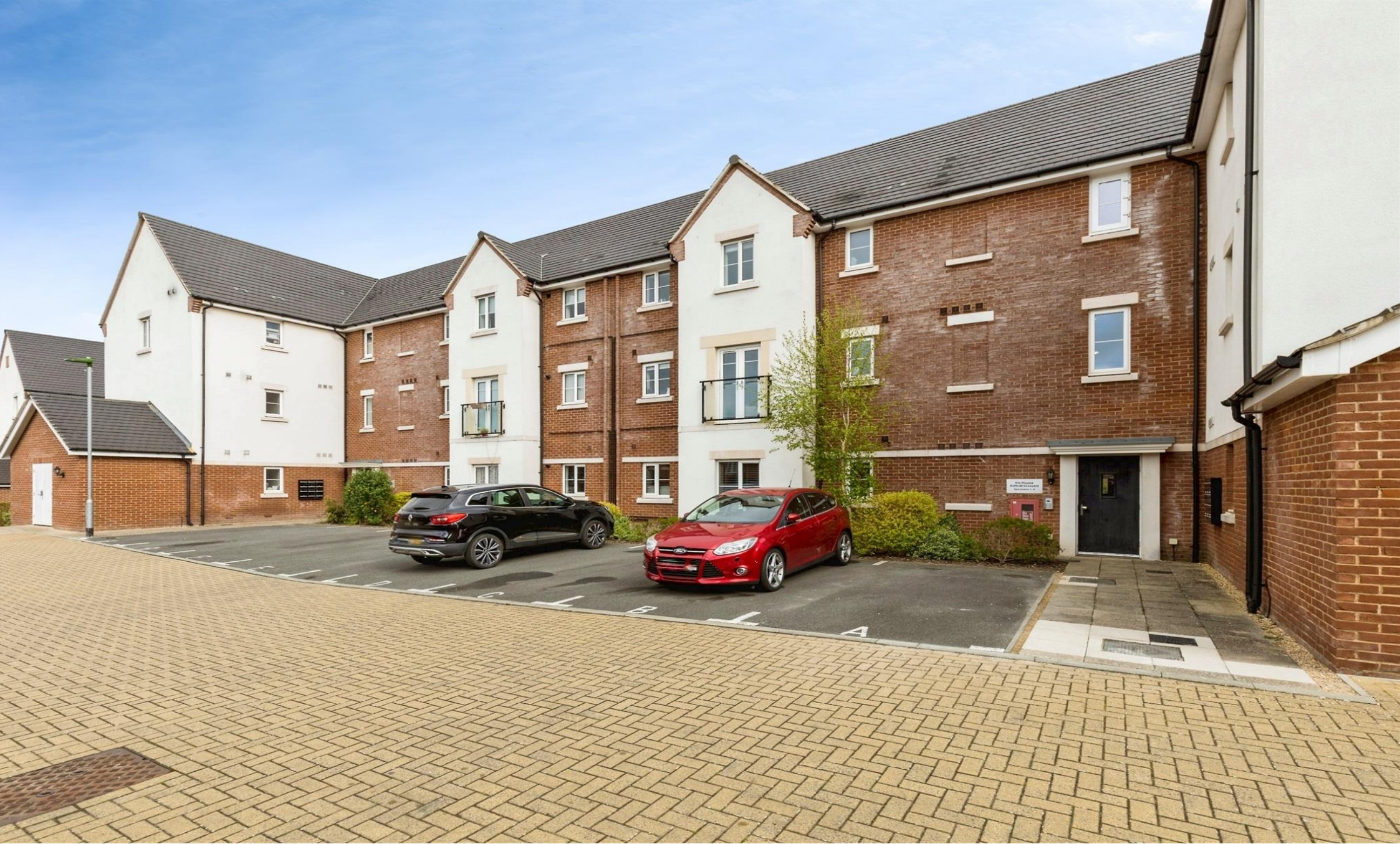
Iris House Daffodil Crescent, Crawley RH10 3GP