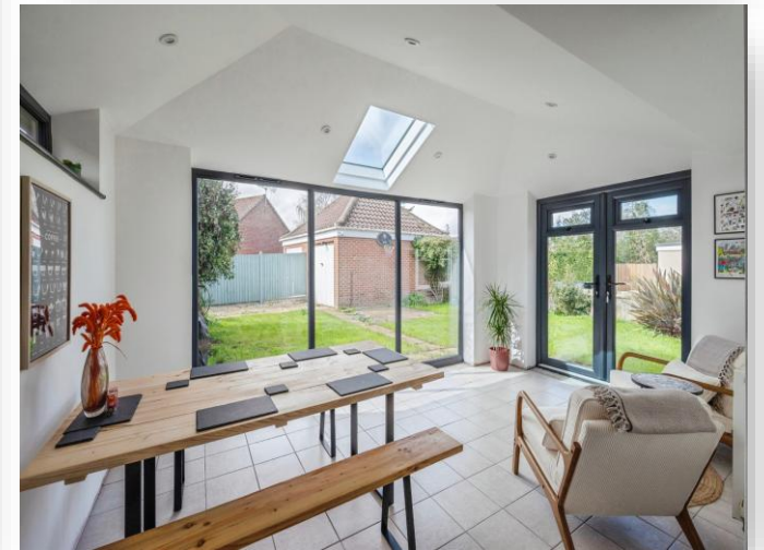
Jubilee Close, Erpingham, Norwich, NR11 7QZ