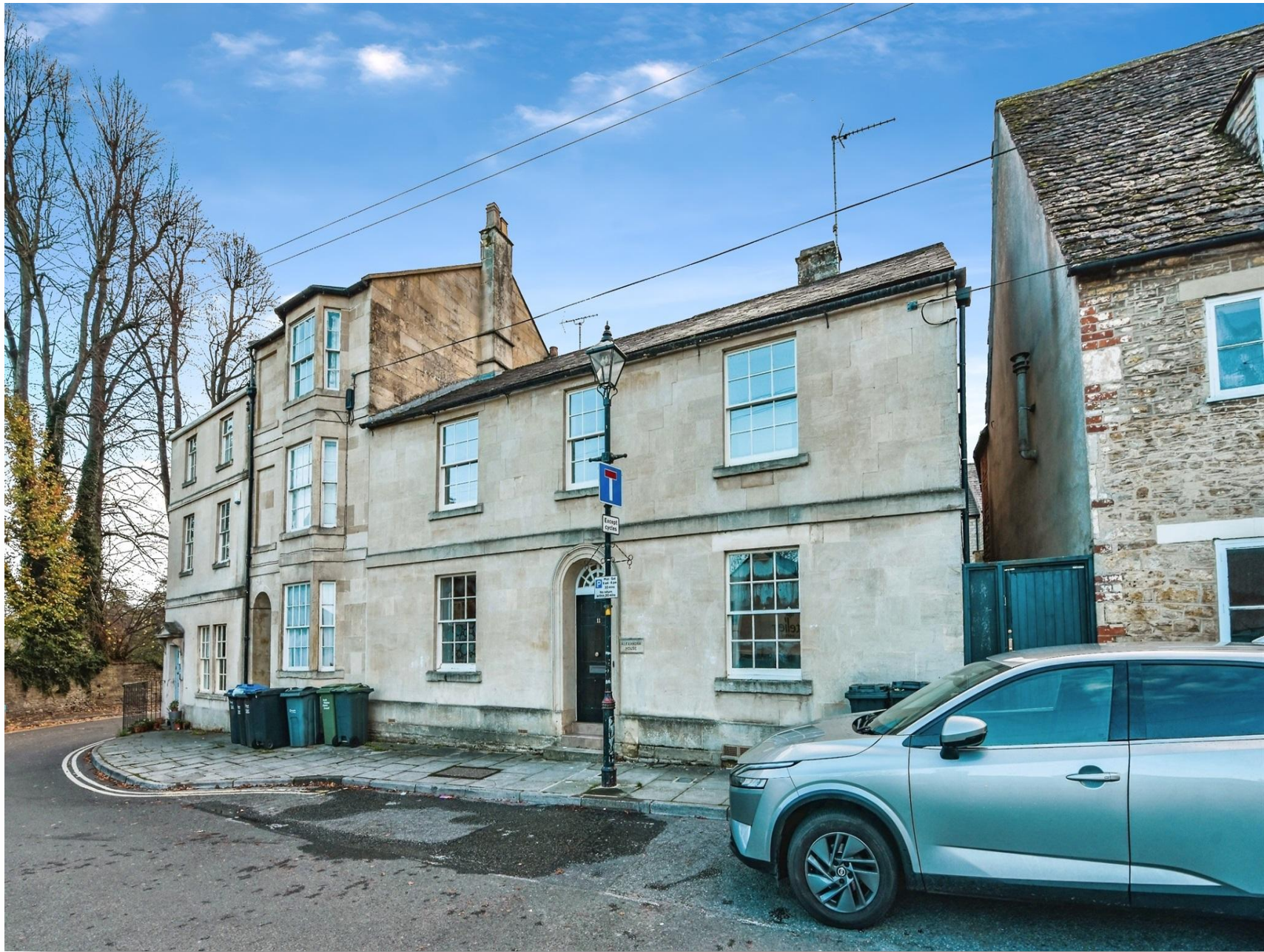
St. Mary Street, Chippenham SN15 3JJ