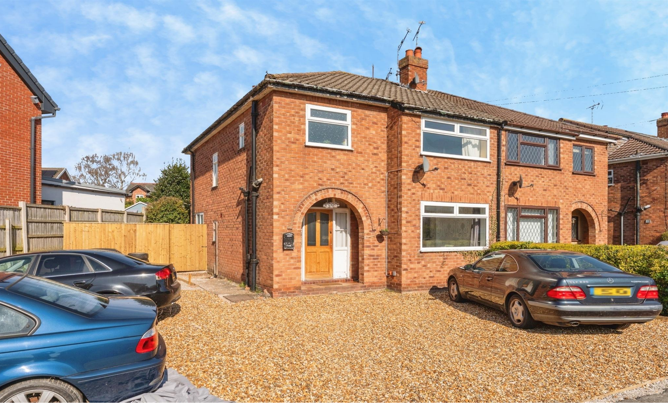
Hawthorn Road, Christleton Chester CH3 7BL