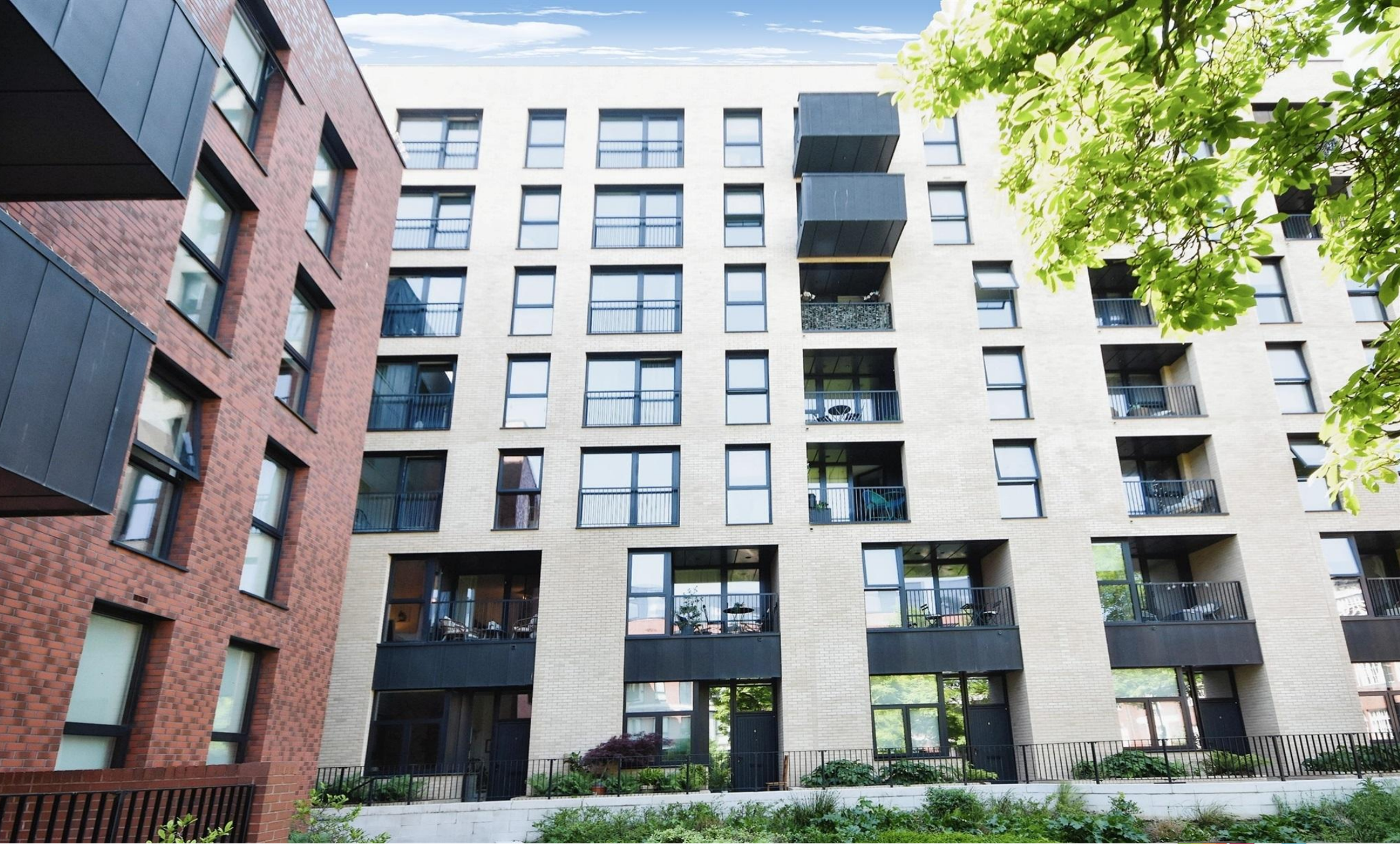
Newcombe Court, Burgess Springs, Chelmsford CM1 1QN