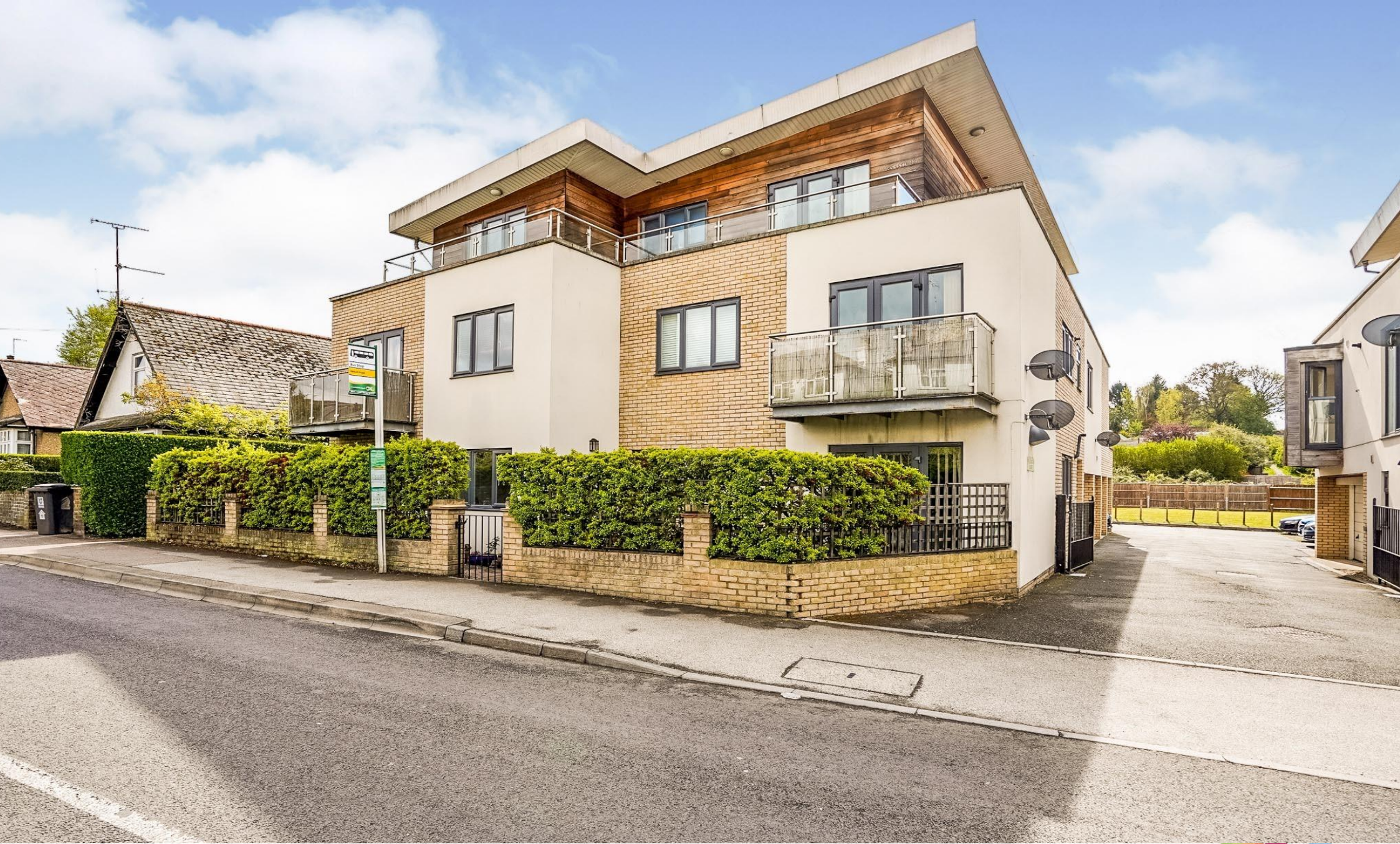
Wellington Court St. Albans Hill, Hemel Hempstead HP3 9NQ