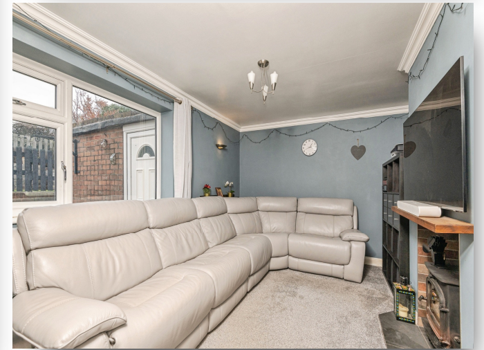
Broomy Lea Lane, HOLMFIRTH HD9 3EN