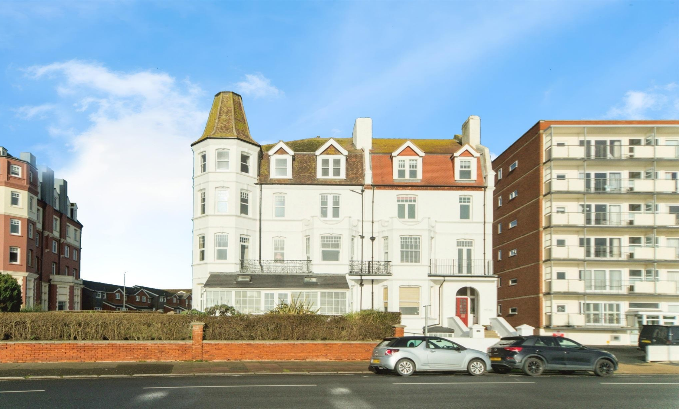
The Links, Bexhill-On-Sea TN40 1EW