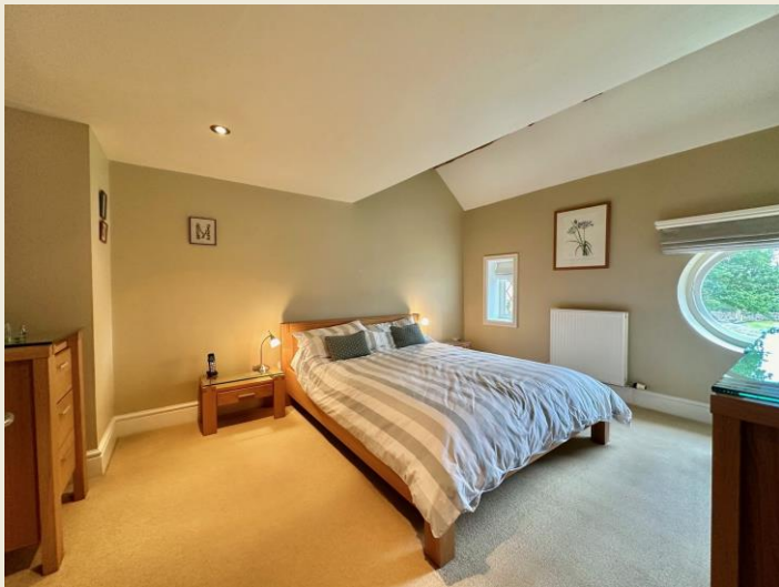
MASTER BEDROOM ONE (14'4 x 11'6) Double room.