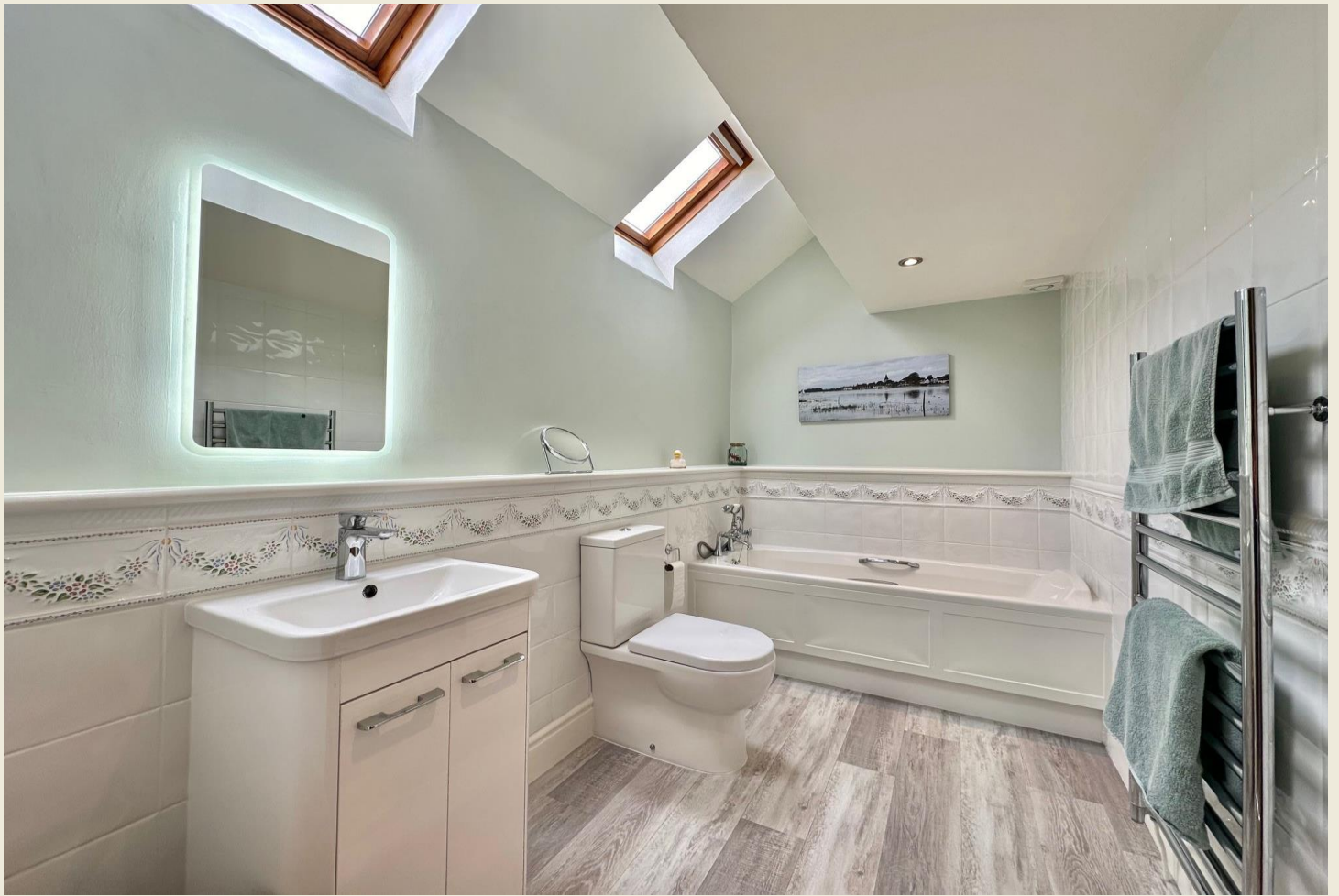
FAMILY BATHROOM (10'9 x 6'1)