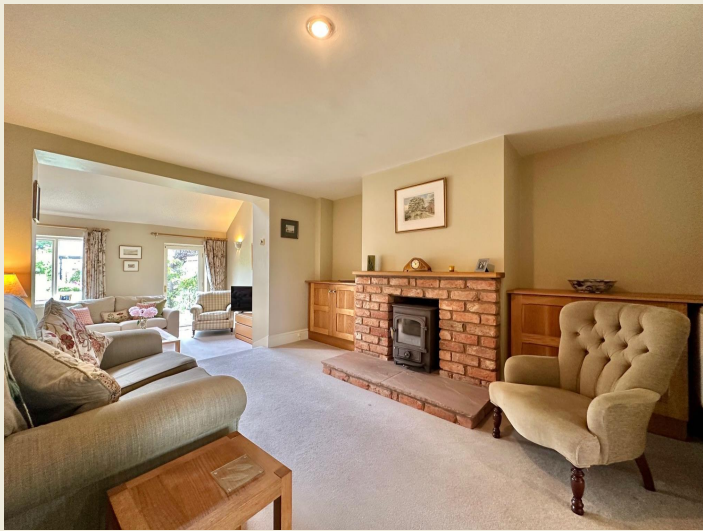
SITTING ROOM (12'7 x 11'4)