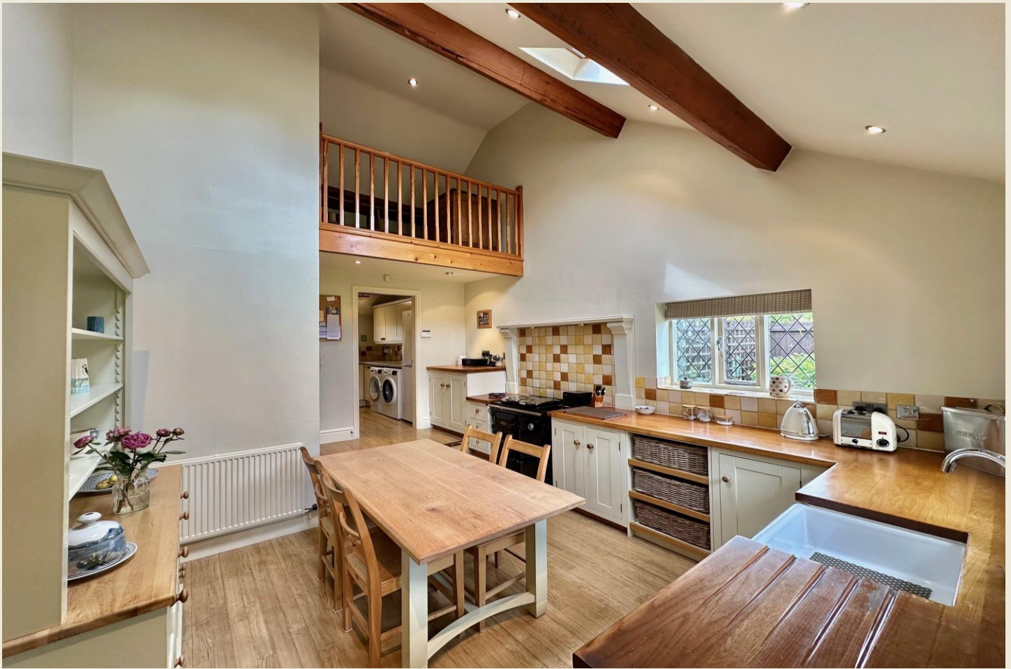
KITCHEN DINER (16'5 x 12'0)