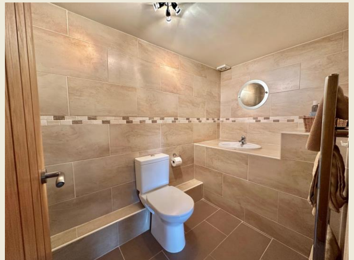
ENSUITE SHOWER ROOM (10'10 x 4'11)