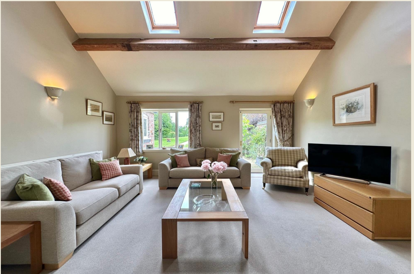
LIVING ROOM (14'10 x 11'7)