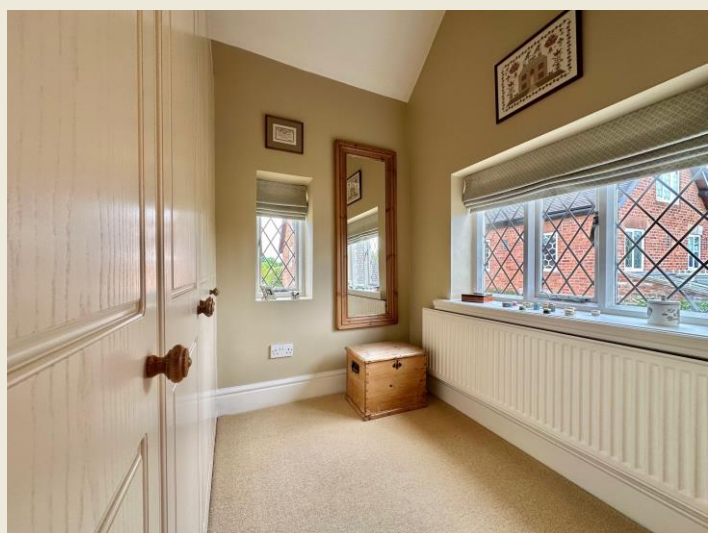
BEDROOM THREE (9'9 x 6'4) Single room.