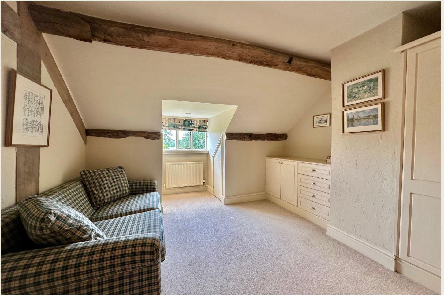
BEDROOM TWO (16'8 x 11'5) Double room.