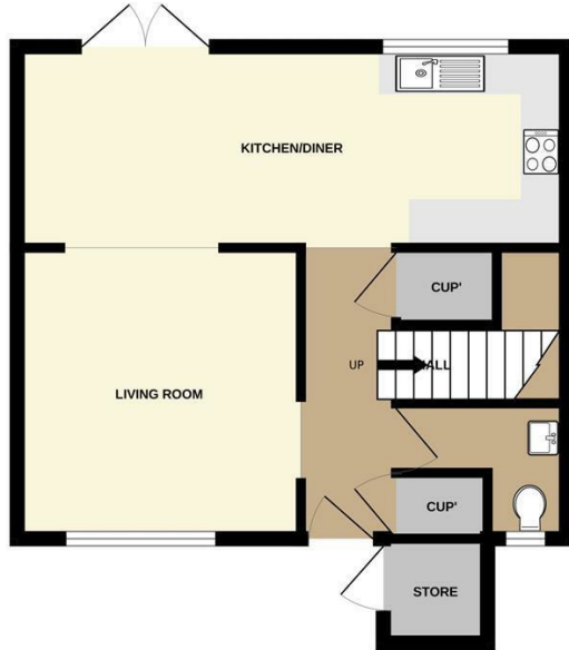
GROUND FLOOR 422 sq.ft. (39.2 sq.m.) approx.