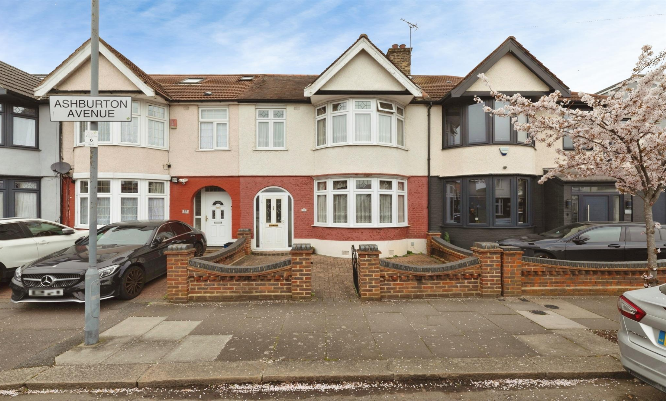
Ashburton Avenue, Ilford, IG3 9ET