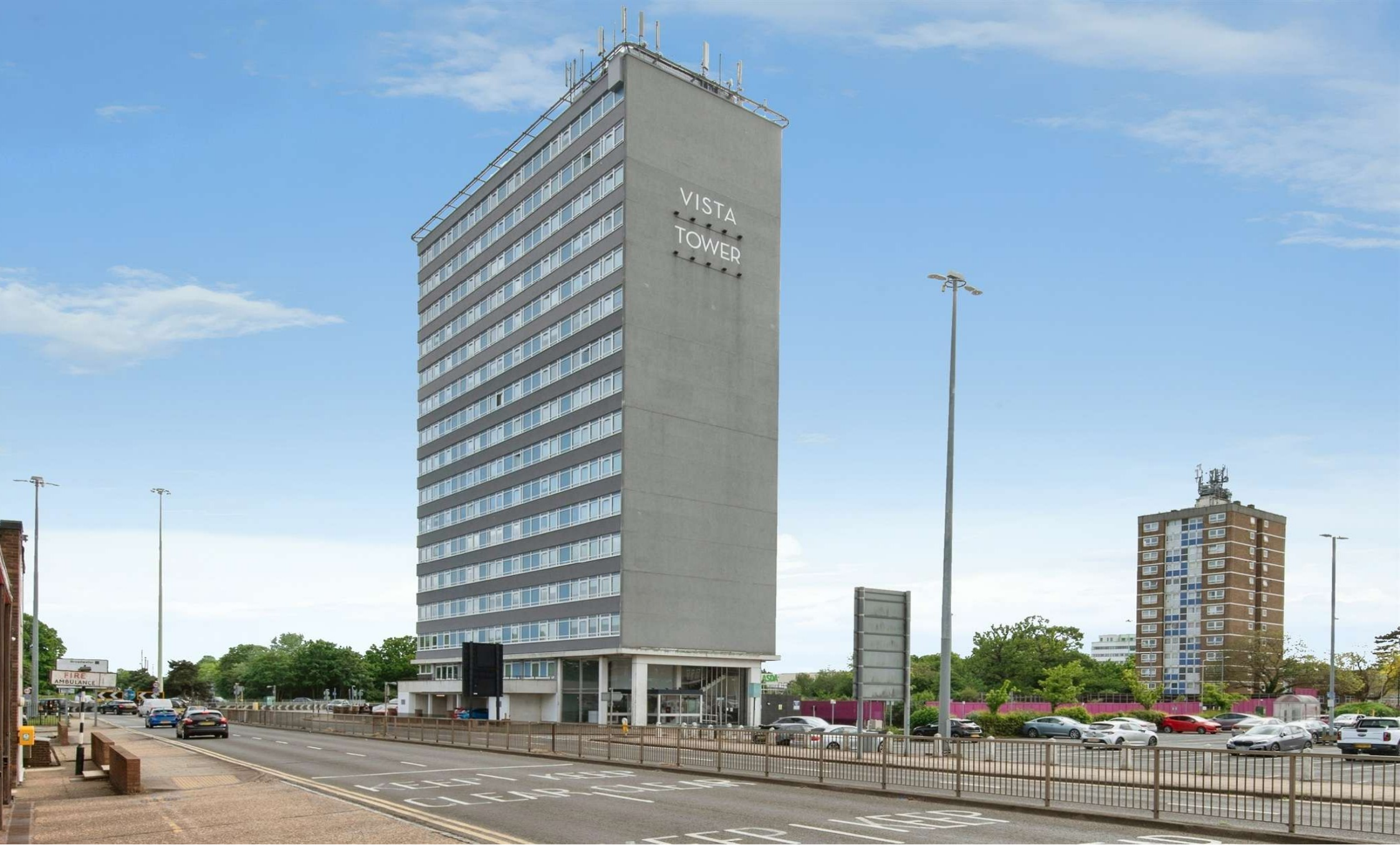
Vista Tower, Southgate, Stevenage, SG1 1AR