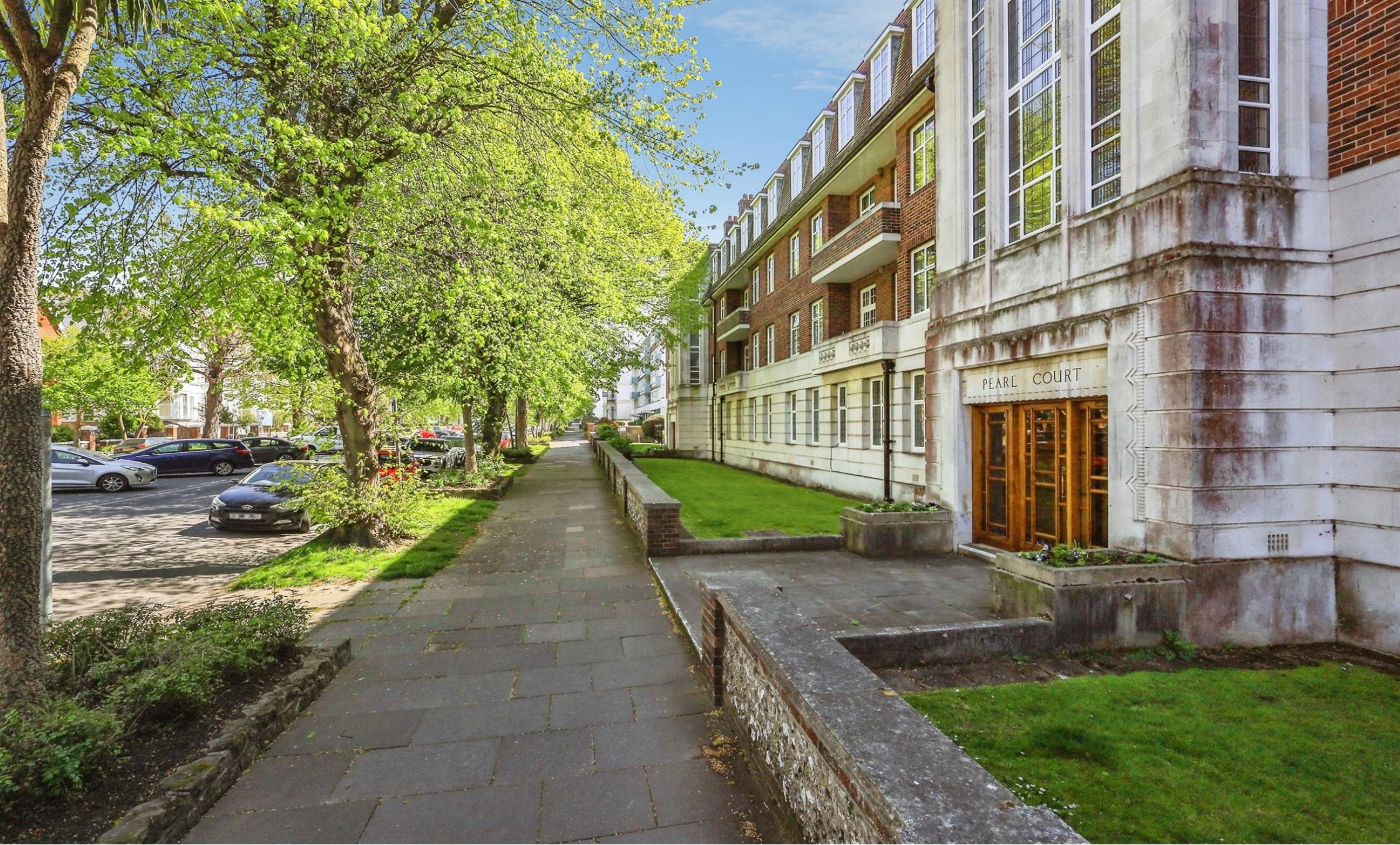
Pearl Court Devonshire Place, Eastbourne BN21 4AB