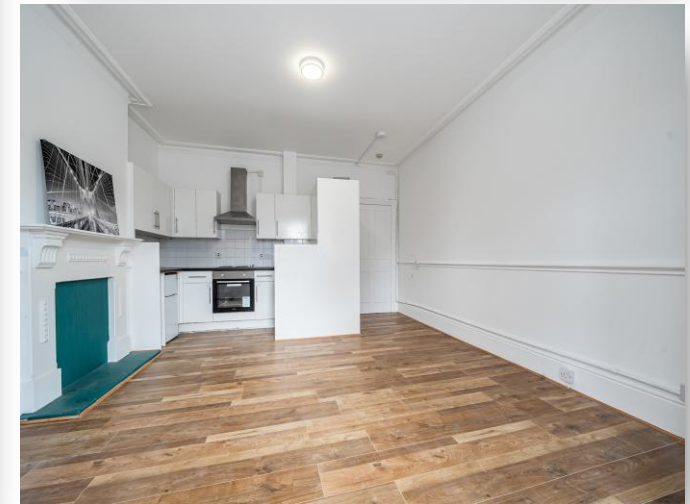
Flat 6 Flint Lodge, Ray Park Road, Maidenhead SL6 8QR