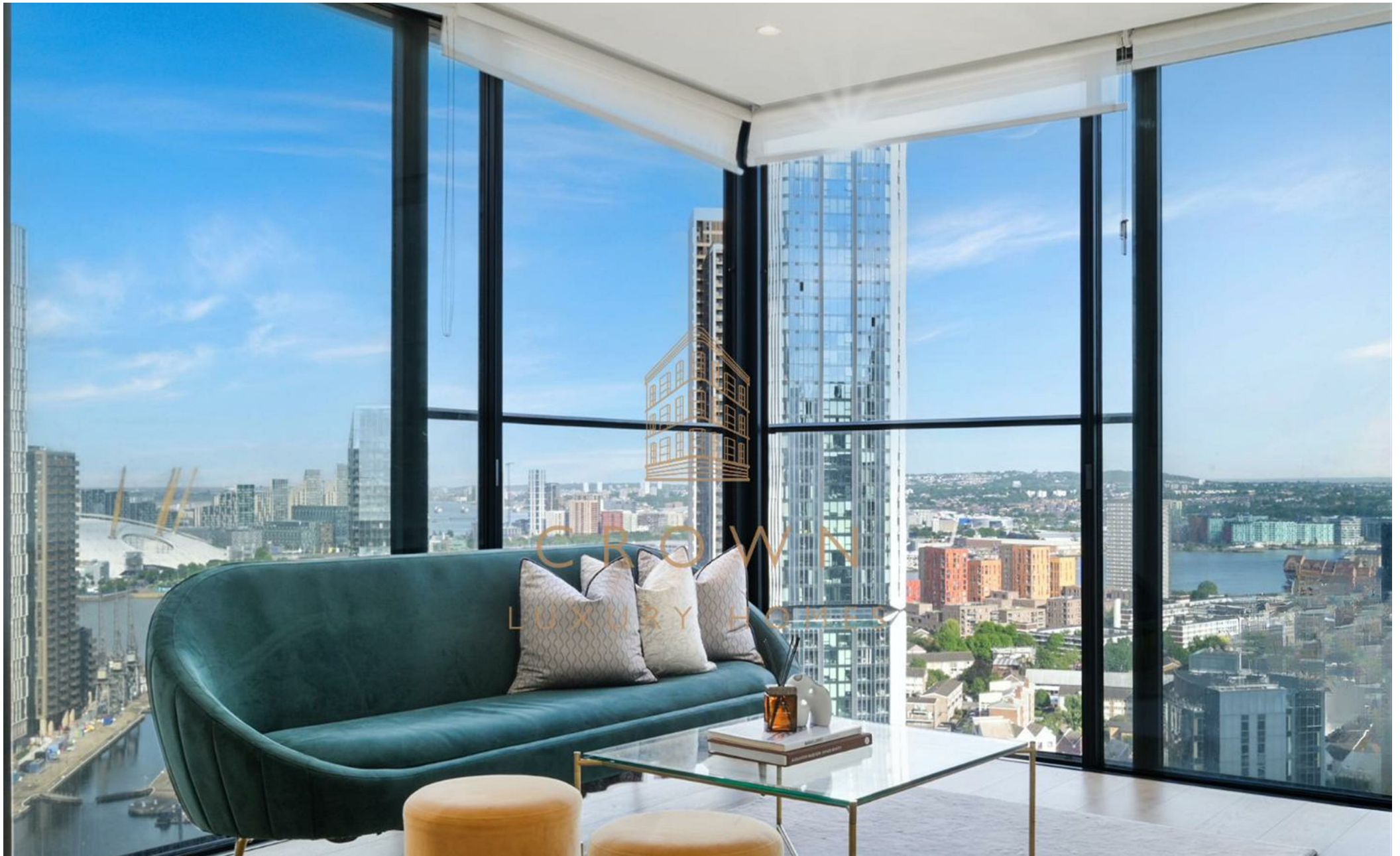
Apartment 2501, Hampton Tower 75 Marsh Wall, London, E14 9RA £4,600 Per month