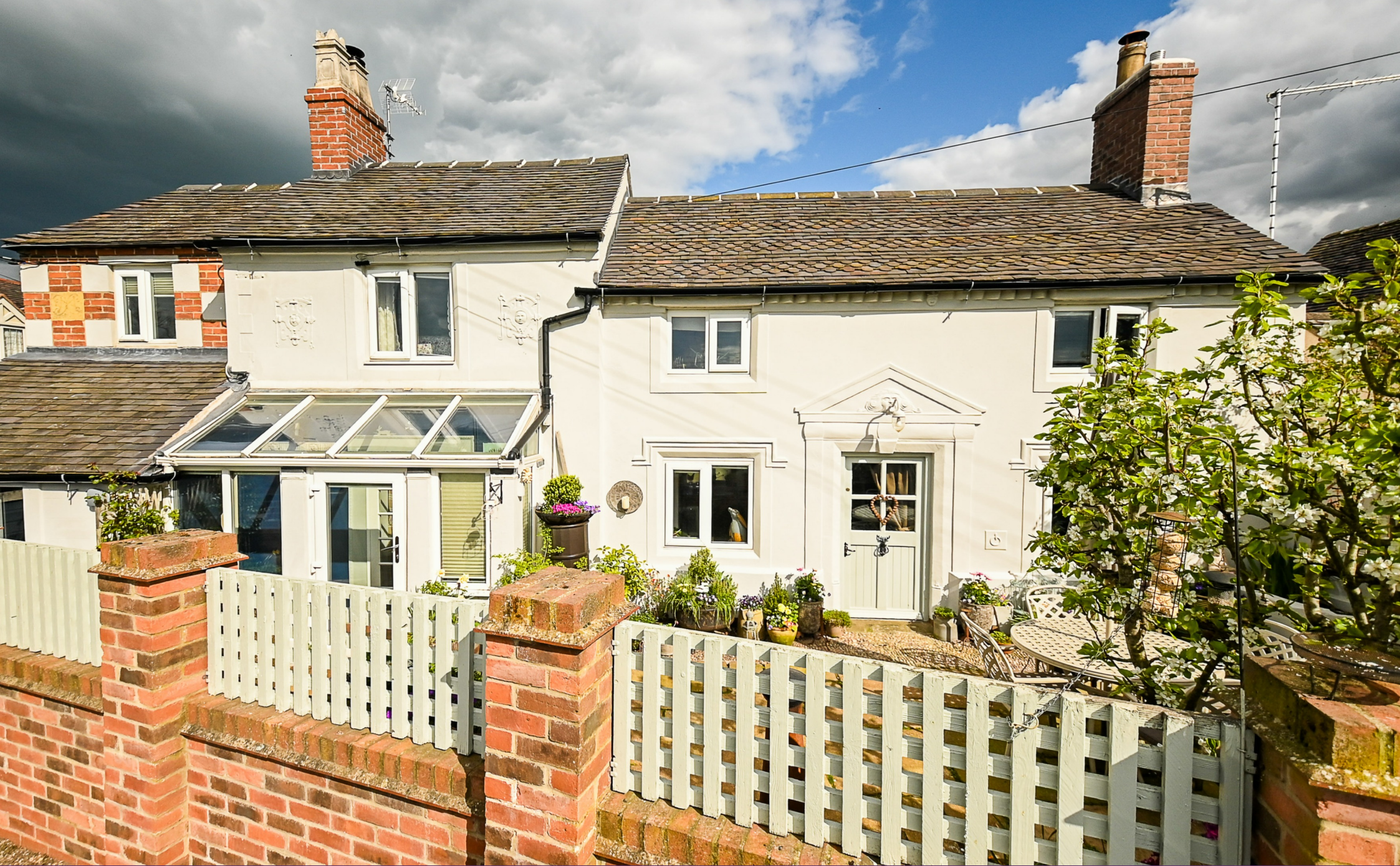
Spa Cottage, Anslow Road, Hanbury, DE13 8TJ