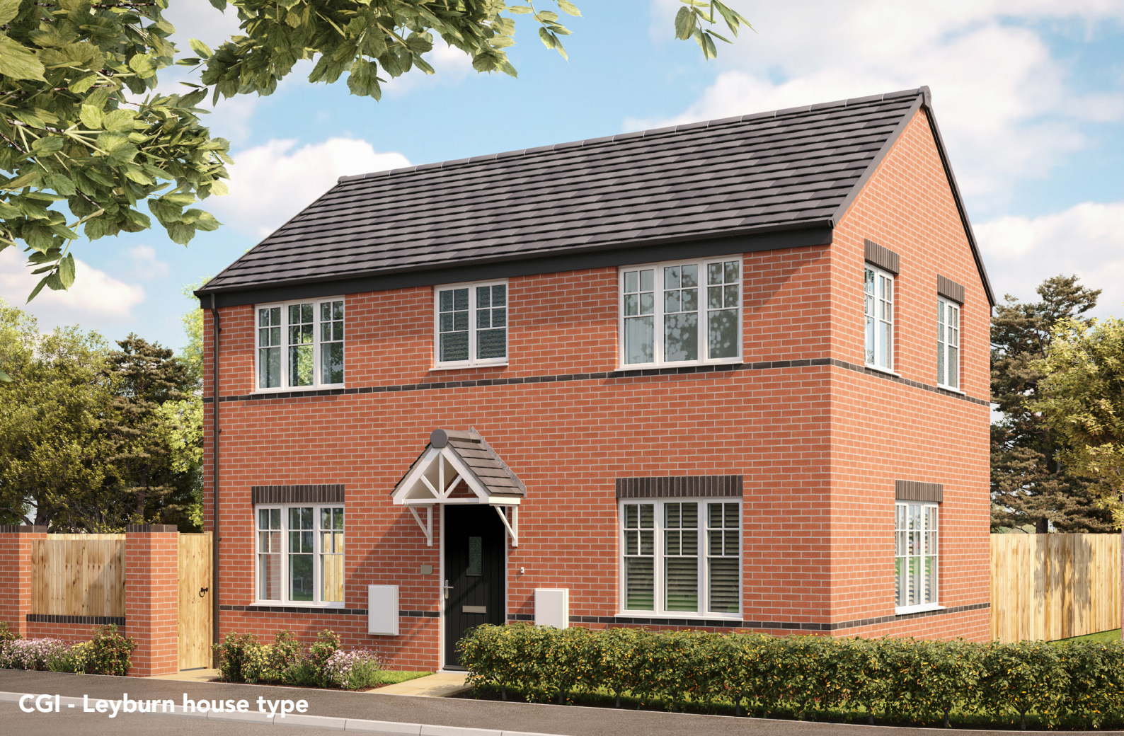
CGI - Leyburn house type