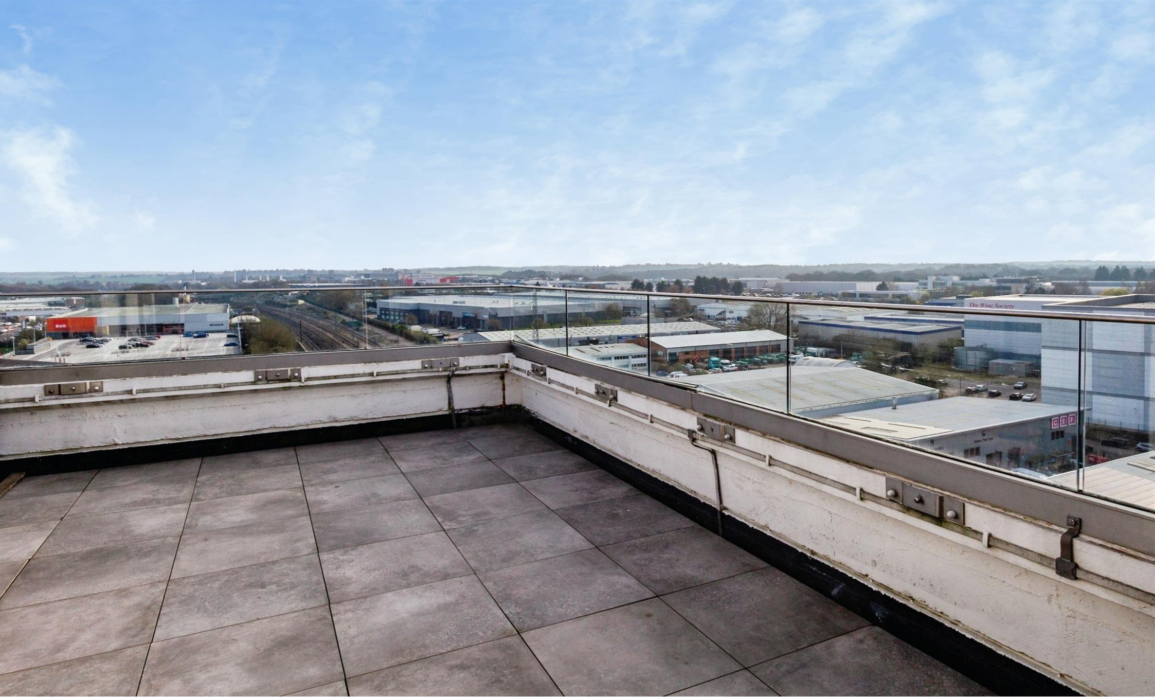
Six Hills House, Kings Road, Stevenage SG1 1AW