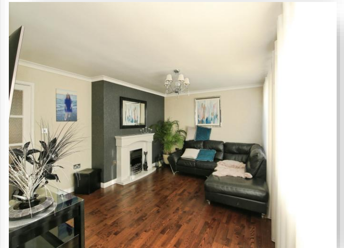
Oakwood, Bank Drive, Wisbech, PE13 1PX