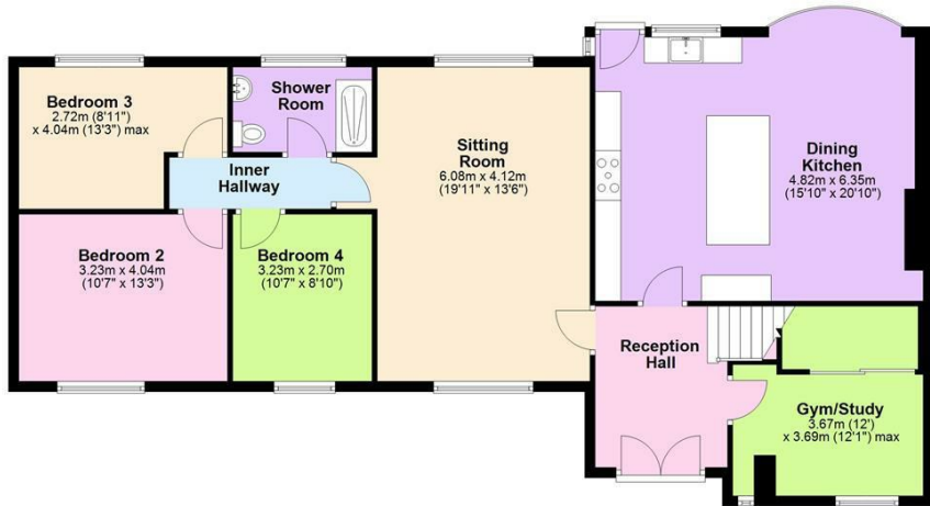
Ground Floor Approx. 122.9 sq. metres (1323.2 sq. feet)