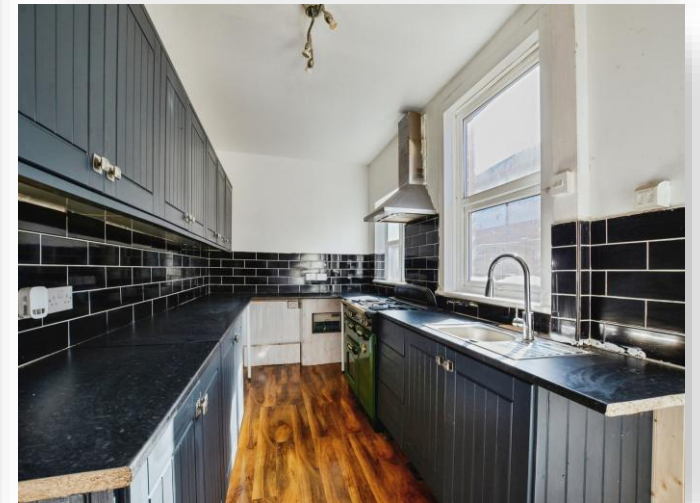
Grosvenor Road, SKEGNESS PE25 2DD