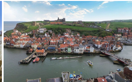
OLD CUSTOM HOUSE, WHITBY- 2 bed Town House -£499,950