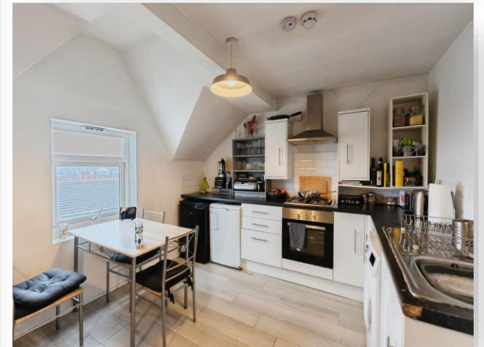
Grange Road West, Prenton, CH43 4XB